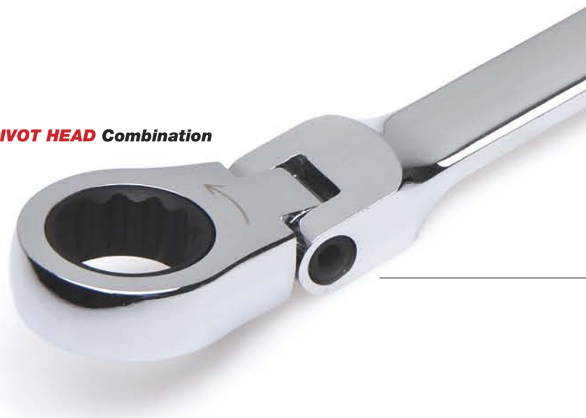
PIVOT HEAD Combination

15-degree offset for better leverage, greater comfort, and fewer skinned knuckles.